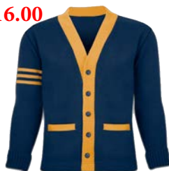
Right Sleeve Stripes

To SEE your sweater design, use the Apparel Builder!