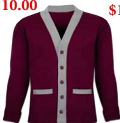
No Sleeve Stripes