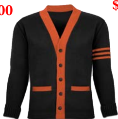
Left Sleeve Stripes