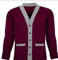
No Sleeve Stripes