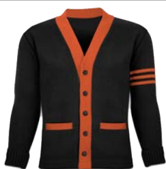
Left Sleeve Stripes