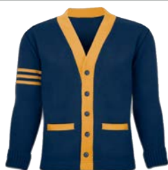
Right Sleeve Stripes

To SEE your sweater design, use the Apparel Builder!