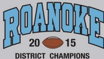
Layout 13-2 (2-Color)