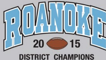
Layout 13-3 (3-Color)

Multiple Activity Icons and Mascots are Available for Customization!