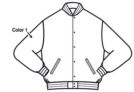
Standard Jacket w/set-in sleeves (showing 3 piece sleeve option)