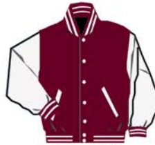
JW225P03 #25 OK Cardinal body #02 White sleeves Mrn/Wht-A White snaps