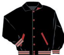
JW225W18 #06 Black body #20 Scarlet collar/Pkt Trim Blk/Wht/Red-B Red snaps