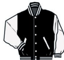
JW225P17 #06 Black body #02 White sleeves Blk/Wht-A White snaps