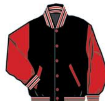
JW225L21 #06 Black body #26 Dark Red sleeves Blk/Wht/Red-B Red snaps