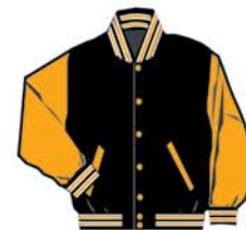
JW225P18 #06 Black body #4J New Gold sleeves Blk/Wht/Gld-B Gold snaps