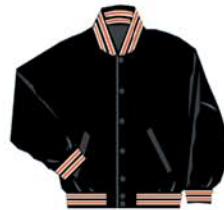
JW225P22 #06 Black body #06 Black sleeves Blk/Wht/Red-B Black snaps