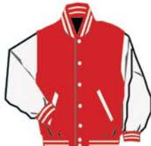
JW225L01 #20 Scarlet body #0B Antique Wht sleeves* Red/Wht-A White snaps