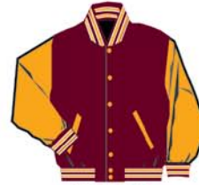
JW225P04 #25 OK Cardinal body #4J New Gold sleeves Mrn/Wht/Gld-B Gold snaps