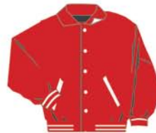
JW225W01 #20 Scarlet body #02 White collar/pkt trim Red/Wht-A White snaps