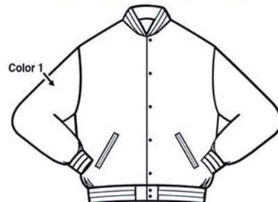
Standard Jacket w/set-in sleeves (showing 3 piece sleeve option)