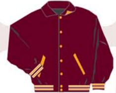
JW225W03 #25 OK Cardinal Body #4J New Gold collar/pkt trim Mrn/Wht/Gld-B Gold snaps