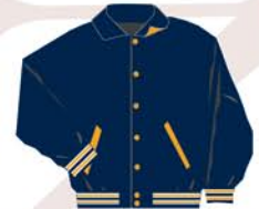
JW225W09 #1P Lt Navy Body #4J New Gold collar/pkt trim Nvy/Wht/Gld-B Gold snaps