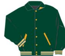
JW225W05 #3D Dartmouth body #4J New Gold collar/pkt trim Dar/Wht/Gld-B Gold snaps