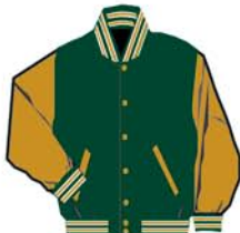
JW225L08 #3D Dartmouth body #4G Lt Gold sleeves Dar/Wht/Gld-B Gold snaps