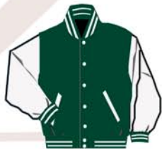
JW225P07 #3D Dartmouth Body #02 White sleeves Dar/Wht-A White snaps