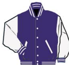
JW225P15 #7A Purple body #02 White sleeves Prp/Wht-A White snaps