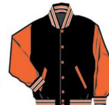
JW225L18 #06 Black body #51 Orange sleeves Blk/Wht/Org-B Orange snaps