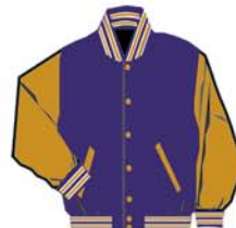
JW225L15 #7A Purple body #4G Lt Gold sleeves Prp/Wht/Gld-B Gold snaps