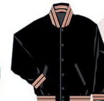
JW225L19 #06 Black body #06 Black sleeves Blk/Wht/Org-B Black snaps