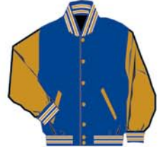
JW225P11 #1L Royal 47 body #42 Gold sleeves Ryl/Wht/Gld-B Gold snaps