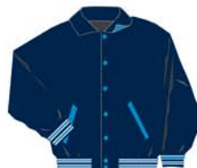
JW225W11 #1P Lt Navy body #09 Columbia collar/pkt trim Nvy/Wht/Clm-B Columbia snaps