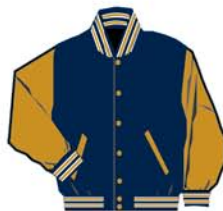
JW225P14 #1P Lt Navy body #42 Gold sleeves Nvy/Wht/Gld-B Gold snaps