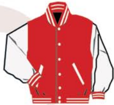
JW225P01 #20 Scarlet body #02 White sleeves Red/Wht-A White snaps