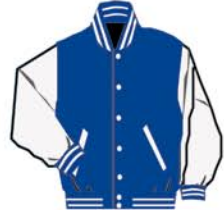
JW225P09 #1L Royal 47 body #02 White sleeves Ryl/Wht-A White snaps