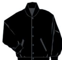
JW225L22 #06 Black body #06 Black sleeves Blk-F Black snaps

See page 10-11 for our complete selection of Wool and Leather colors plus coordinating knit trim patterns