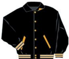
JW225W16 #06 Black body #4J New Gold collar/pkt trim Blk/Wht/Gld-B Gold snaps