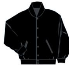
JW225P23 #06 Black body #06 Black sleeves Blk-F Black snaps