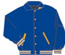
JW225W07 #1L Royal 47 body #4J New Gold collar/pkt trim Ryl/Wht/Gld-B Gold snaps