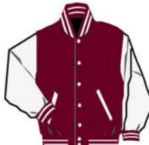
JW225L03 #25 OK Cardinal body #0B Antique Wht sleeves* Mrr/Wht-A White snaps