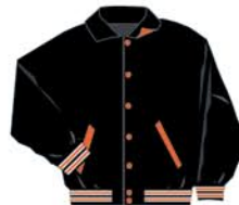
JW225W17 #06 Black body #51 Orange collar/pkt trim Blk/Wht/Org-B Orange snaps