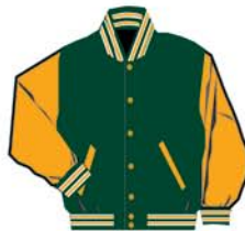
JW225P08 #3D Dartmouth body #4J New Gold sleeves Dar/Wht/Gld-B Gold snaps