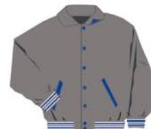
JW225W14 #60 Grey body #12 Royal collar/pkt trim Gry/Wht/Ryl-B Royal snaps