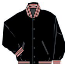
JW225L20 #06 Black body #06 Black sleeves Blk/Wht/Red-B Black snaps