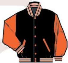
JW225P20 #06 Black body #51 Orange sleeves Blk/Wht/Org-B Orange snaps