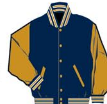
JW225L12 #1P Lt Navy body #4G Lt Gold sleeves Nvy/Wht/Gld-B Gold snaps