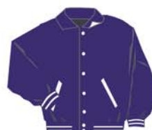
JW225W12 #7A Purple body #02 White collar/pkt trim Prp/Wht-A White snaps