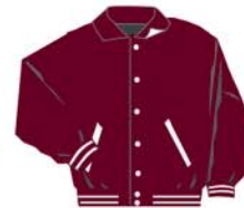
JW225W02 #25 OK Cardinal body #02 White collar/pkt trim Mrn/Wht-A White snaps