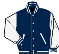
JW225P12 #1P Lt Navy body #02 White sleeves Nvy/Wht-A White snaps