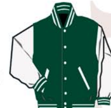
JW225L07 #3D Dartmouth body #0B Antique Wht sleeves* Dar/Wht-A White snaps