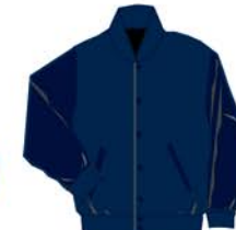
JW225L13 #1P Lt Navy body #14 Navy sleeves Navy-F Navy snaps