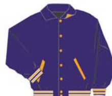
JW225W13 #7A Purple body #4J New Gold collar/Pkt Trim Prp/Wht/Gld-B Gold snaps