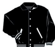
JW225W19 #06 Black body #02 White collar/pkt trim Blk/Wht-A White snaps