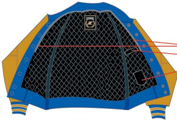
Jacket lining detail showing EZ-Appique zipper & Inside Pockets

All jackets (Except for JW614/JW614W, JW601/JW601W & youth sizes) come with: