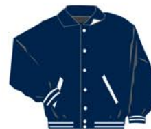
JW225W08 #1P Lt Navy body #02 White collar/pkt trim Nvy/Wht-A White snaps