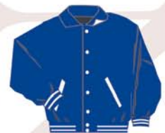
JW225W06 #1L Royal 47 body #02 White collar/pkt trim Ryl/Wht-A White snaps