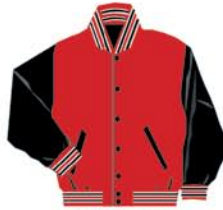
JW225P02 #20 Scarlet body #06 Black sleeves Red/Wht/Blk-B Black snaps