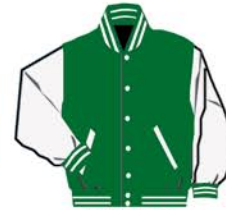
JW225P06 #3G Dark Kelly body #02 White sleeves Kly/Wht-A White snaps