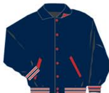
JW225W10 #1P Lt Navy body #20 Scarlet collar/pkt trim Nvy/Wht/Red-B Red snaps