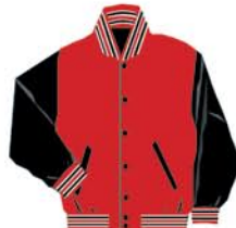
JW225L02 #20 Scarlet body #06 Black sleeves Red/Wht/Blk-B Black snaps