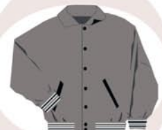
JW225W15 #60 Grey body #06 Black collar/Pkt Trim Gry/Wht/Blk-B Black snaps