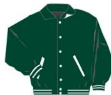
JW225W04 #3D Dartmouth body #02 White collar/pkt trim Dar/Wht-A White snaps