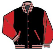
JW225P21 #06 Black body #20 Scarlet sleeves Blk/Wht/Red-B Red snaps